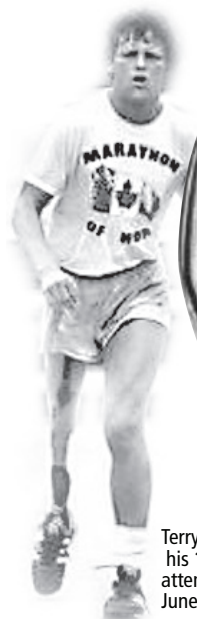
Terry Fox during his 1980 cross-country attempt. He died in June 1981 aged 21.

Fox commemorative coin is a first for Canada—it shows the likeness of a person other than a monarch