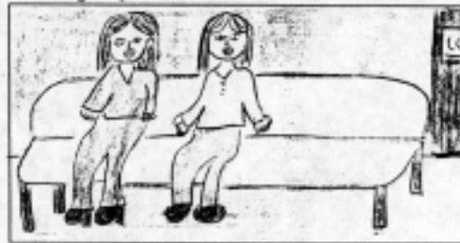
student observing a case