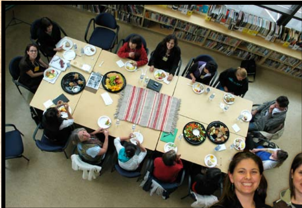
Provincial committee meeting / École Victor-Brodeur, Victoria Songhees and Esquimalt First Nations Territory

These three questions were also addressed at regional and provincial meetings and form the basis for the notes from the meetings which are blogged on the CSF website and also for the enhancement agreement framework itself.