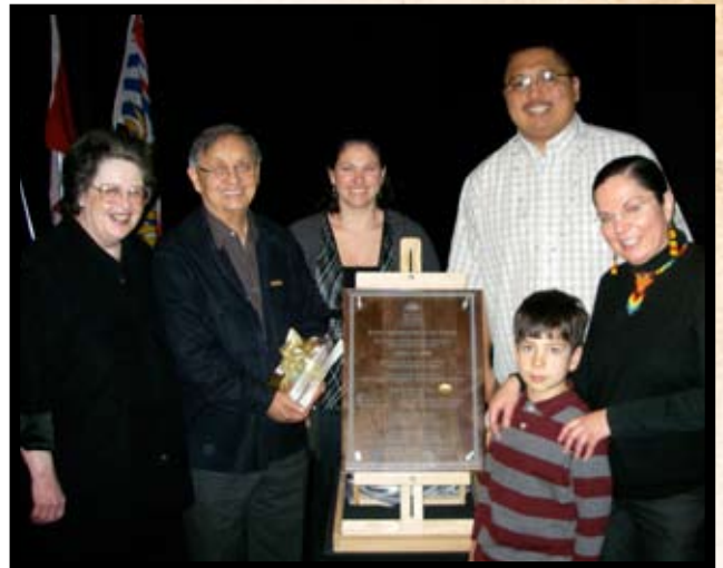
Official opening of the secondary school Jules-Verne, Vancouver / Musqueam First Nation Territory

Acknowledgethetraditionalteachingsofthe Elders and the wisdom of their Aboriginal culture