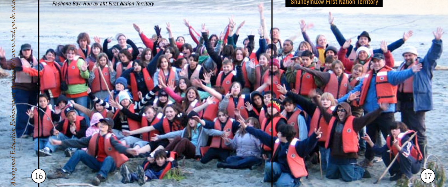
Pachena Bay, Huu ay aht First Nation Territory