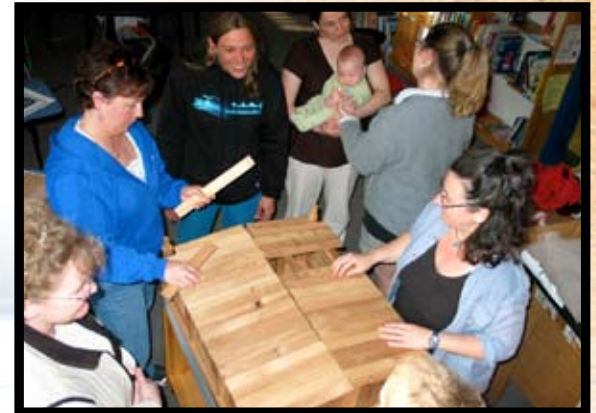
École Océane, Nanaimo / Snuneymuxw First Nation Territory

Most respondents expressed a need for an annual provincial weekend gathering where older students (i.e. Grades 5-12) could live together a rich academic and cultural experience with other francophone Aboriginal students and parents. (This could be along the lines of the gatherings organized at the Bamfield Marine Sciences Centre in Huu Ay Aht First Nations Territory in 2006, 2007 and 2008) One-day regional annual gatherings for the K-7 students could also take place in different culturally significant contexts each year in the four regions of the province (Coast, Southern Interior, Northern Interior, Kootenay) on a rotating basis, thus offering younger students the opportunity to experience the diversity of traditional and contemporary Aboriginal cultures adapting to the diversity of environments in BC.