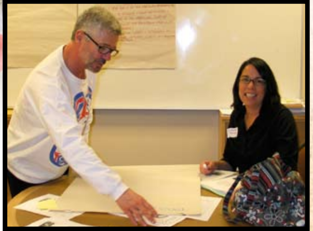
Vancouver / Musqueam First Nation Territory