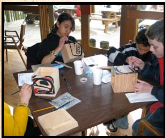
Bamfield / Huu ay aht First Nation Territory