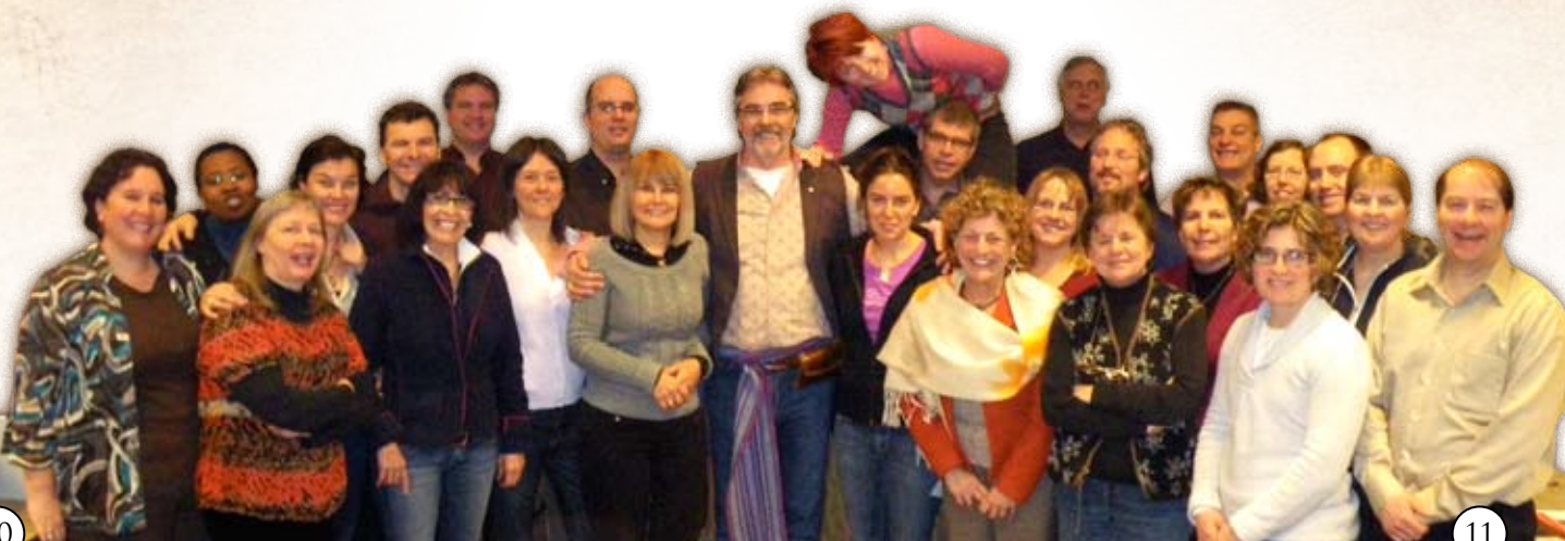
Aboriginal literacy activity

The Advisory Committee will establish targets in the first year of the EA.