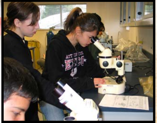
Bamfield Marine Sciences Centre / Huu ay aht First Nation Territory

The Advisory Committee will collect baseline data and establish targets in the first year of the Enhancement Agreement.