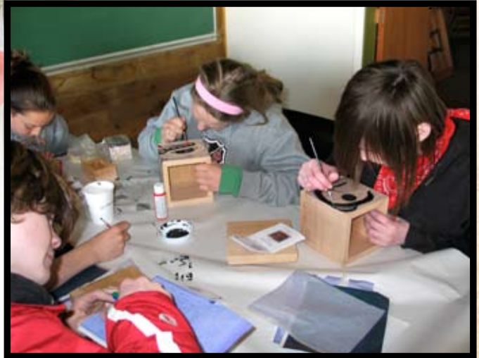
Bamfield / Huu ay aht First Nation Territory