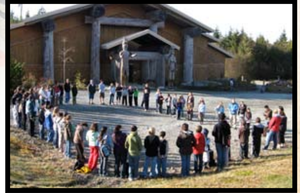
Territoire de la Première Nation Huu ay aht

In order to ensure that all families are aware of the Ministry's and the district's wish to welcome and acknowledge the Aboriginal heritages within its school communities, a letter shall be sent to all parents of CSF students via school mail inviting them to identify their own Aboriginal ancestry, specifying that parents will be taken at their word. No written or legal proof is required since such knowledge is often traditionally oral. In September 2009 this letter will be sent to the parents of all 4300 students within the CSF. Each September thereafter, a similar letter will be sent to all Kindergarten students' families and to all students who are new to the CSF.