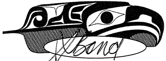
Shirley Bond Minister of Education